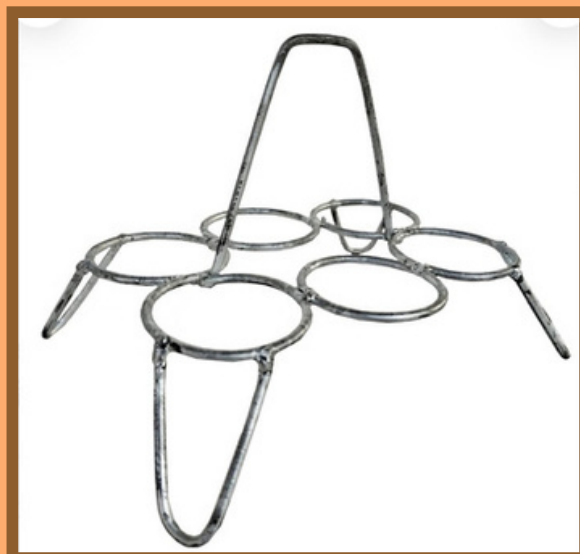
Iron Glass Stand