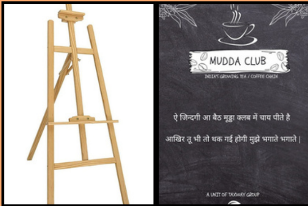
Wooden Stand & Board