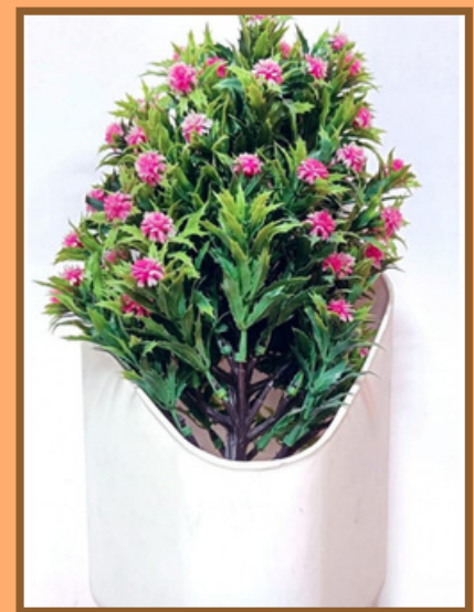
Wall Mounted Flower Pot