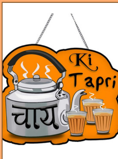
Tea Wall Art Frame